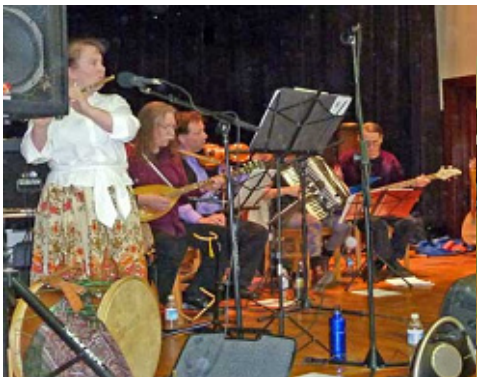
Kafana Klub – the woman playing the flute was also in the Balkan women's vocal ensemble, Svila