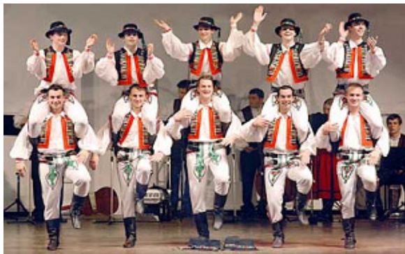
The Duquesne Tamburitzans