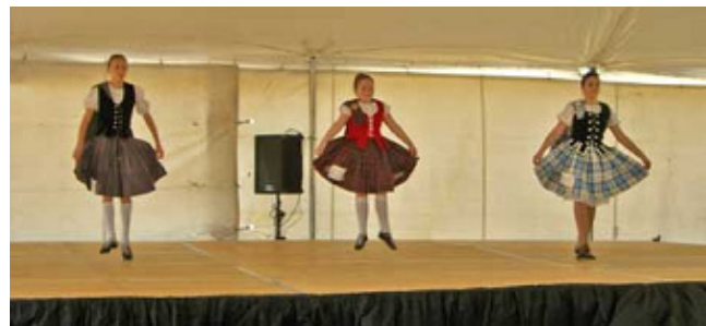
Highland Dance Competition

There were over ten booths set up for selling food, mostly Scottish. They even had haggis, which is a type of sausage, a Scottish delicacy. Also available were forfar bridies and Scottish pies. Both are meat filled, but the forfar bridies have the dough all around, where the Scottish pies has the dough on top only. There were around 20 vendors selling everything Scottish from clothing (kilts, hats, scarves, shirts and ties) to tablecloths and other home decor. I bought a mouse pad with my Henderson tartan and name on it.