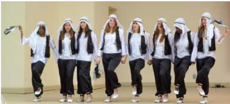
Turkish Festival: Rivercity Science Academy Dance Group from Jacksonville