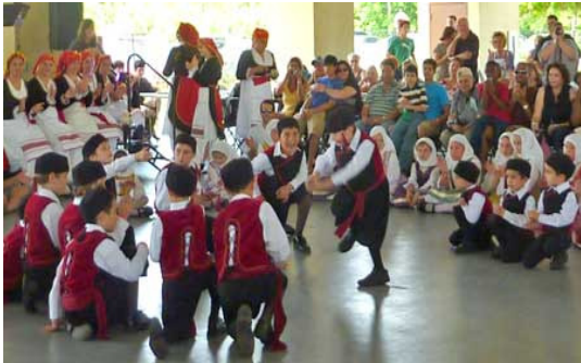
Maitland Greek Festival: youngest group of performers doing a zeibekiko.

The last two months have been very busy in Orlando, with a lot of dancing and dance-related opportunities. In late April, the annual Greek Festival was held in Maitland (Orlando area). Many members of our group attended and enjoyed the food, the music and the dance. It was so not terribly hot as it had been in previous years. There were three different performing groups of different ages, with the youngest performer being three and the oldest 30-something. They seem to show new dances every year, which is pleasant.