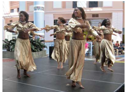
NuLook Dance Theater performing African dance

This year's event, once again free of charge to the audience, was both entertaining and educational. Many of the groups included easy audience participation sessions in their performances. 2010 World Dance Day marked Orlando's fifth celebration of this cultural event with the City's Mayor, Buddy Dyer, and Orange County's Mayor, Richard Crotty, both signing proclamations declaring it World Dance Day in Orlando and Orange County respectively. These proclamations were reprinted in the programs for the approximately 1,000 people who performed in and attended the event.