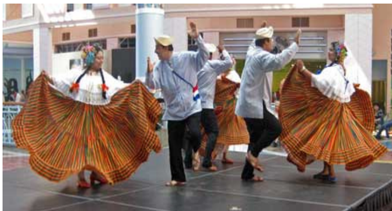
Sentimiento Panamenco performing folkloric dances from Panama

Ethnic folk dance was well-represented with performances chosen to showcase Spanish Flamenco and classical Spanish, Bollywood, international Zumba, American clogging, traditional Middle Eastern folkloric, belly dance, global gypsy, Latin, African, Caribbean, and traditional folkloric dances of Haiti, India, Panama and Mexico.