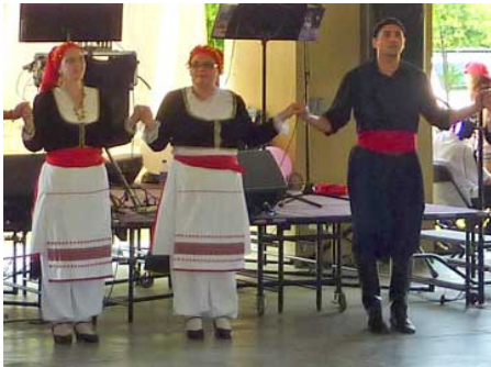
Greek Festival: oldest group waiting to perform

The following day, April 25, the first Orlando Turkish Festival was held in downtown Orlando at the bandshell at Lake Eola. Bobby and I arrived at noon, when it was supposed to start, but they were just setting up a big tent for eating hanging decorations. At 1 PM, the program began with mostly Turkish dance groups. There were two children's groups and an adult group of four who came from North Carolina. I had the impression that not many of them are actually Turkish. The adult group, the Bluestar Turkish Folk Dance Troupe, was very good and represented several regions of Turkey with their dances. A comical dance was performed by the two men with their bellies painted like faces and hoods on their heads that looked like hats. The dance is called Ashuk and Mashuk , with a boy and a girl character and a "boy-meets-girl" story. That and other dances performed by the group are described on their website, bluestardance.org . The food was good, too. I would go again next year.