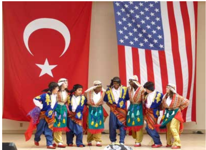
Turkish Festival: Children's group from Orlando Science Schools

The following day, April 25, the first Orlando Turkish Festival was held in downtown Orlando at the bandshell at Lake Eola. Bobby and I arrived at noon, when it was supposed to start, but they were just setting up a big tent for eating hanging decorations. At 1 PM, the program began with mostly Turkish dance groups. There were two children's groups and an adult group of four who came from North Carolina. I had the impression that not many of them are actually Turkish. The adult group, the Bluestar Turkish Folk Dance Troupe, was very good and represented several regions of Turkey with their dances. A comical dance was performed by the two men with their bellies painted like faces and hoods on their heads that looked like hats. The dance is called Ashuk and Mashuk , with a boy and a girl character and a "boy-meets-girl" story. That and other dances performed by the group are described on their website, bluestardance.org . The food was good, too. I would go again next year.