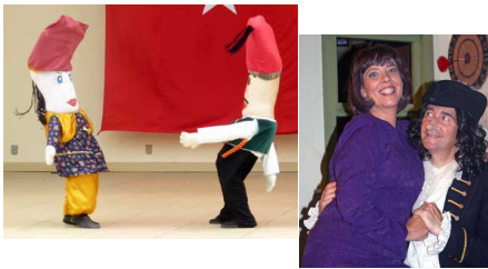
Who? What? Where? See pages 2 and 3