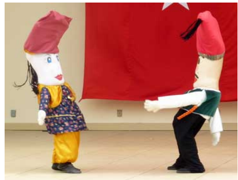
Turkish Festival: Ashuk and Mashuk