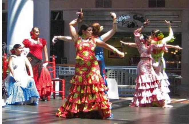
The group Flamenco del Sol performing Spanish Flamenco

World Dance Day was organized by the International Dance Council in Paris on April 29, 1982, and is celebrated every spring throughout the world. The object of World Dance Day events is to educate and entertain a wider public in the art of dance, with special emphasis on performances in non-traditional theater locations that are free and open to the public.