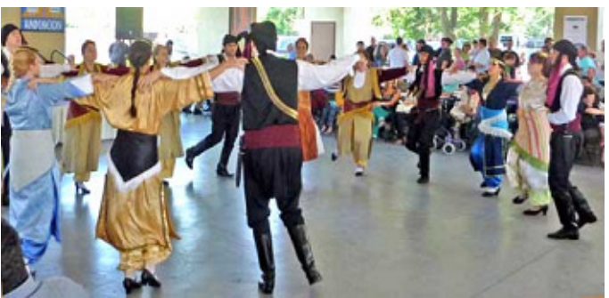
Greek Festival-Orlando Pontic dance suite