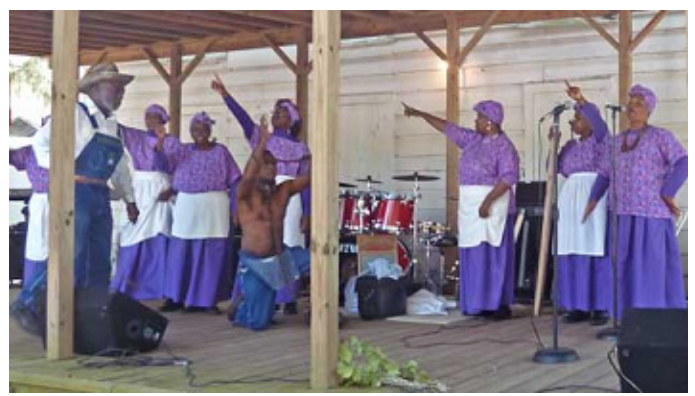
Sapelo Island "Shouters" performing

Auction Item Ideas: Forget quantity; donate quality (curious/exquisite/funny!)